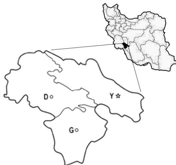
Fig. 2: The geographical view of the study site. (Main cities: Y: Yasooj (the capital); D: Dena; G: Gachsaran)

of 634,000 inhabitants in 2006 (the latest published population census in the country). Yasooj (the capital), Dena, and Gachsaran are the main cities of the province that include 323 AHCs (Figure 2).