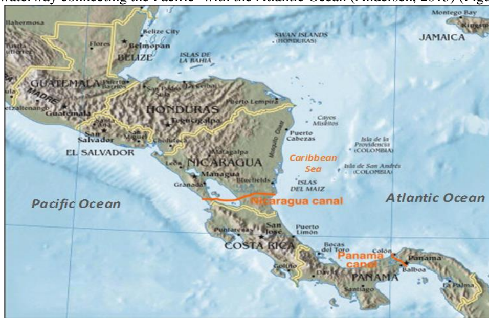
Figure 1: Final suggested route for the interocean canal in Nicaragua.

The Nicaragua Canal would directly compete with the Panama Canal as the largest and longest interoceanic waterway connecting the Pacific- with the Atlantic Ocean (Andersen, 2015) (Figure 1).