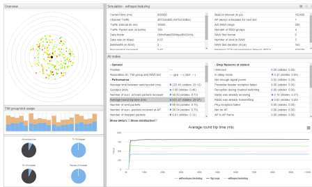
Figure 2: 802.11ah simulation visualizer